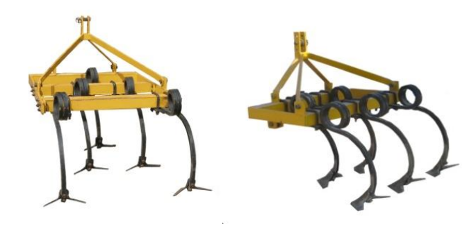
Figure 3: Spring tine cultivator

The prototype I was designed with three rows coil spring tine combine to full sweep tine head assembling in V type (Figure 3). This prototype was used for comparison testing in different tine head size at Rachaburi province in the central plain of Thailand. There are three size of tine head; small size 150 mm, medium size 215 mm and large size 245 mm. The result showed that large size tine head was the best and weeding effective (85.34 %), the theoretical working width was 920 mm (Table 1). The large size of tine head was selected for the prototype. As the problem during testing, the frame structure of three rows had affected to overload of the tractor power. For reducing the load of tractor, the two rows frame structure was designed. The first row assembled 2 units and the second row assembled 3 units of spring tine with full sweep tine head in serrated pattern (figure 3). The comparable testing was conducted with rotary cultivator, rigid tine and disc harrow. The testing was operated in each month of 1-5 months after planting at Khonkhane province (Figure 5). The recorded data was analyzed for weeding efficiency, fuel consumption, working velocity, soil cone penetration force, soil moisture content and production yield. From table 2, the result showed that rotary cultivator did effective weeding, the weeding efficiency was 97.3 %, but the fuel consumption was 6.4 liter/ha.